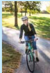
Pioneers Park Lincoln NE