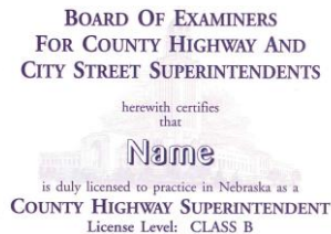
Title 425 - BOARD OF EXAMINERS