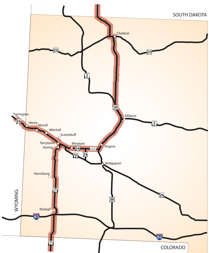
Figure 1.2- The Heartland Expressway Corridor

The Heartland Expressway Corridor will provide an opportunity to improve the efficiency and reliability of freight movements. Currently, many trucking companies schedule shipments to avoid urban congestion times. A rural route to bypass urban congestion along the I-25 corridor will provide opportunities for trucking companies to improve the efficiency and timeliness of shipments within the critical freight network.