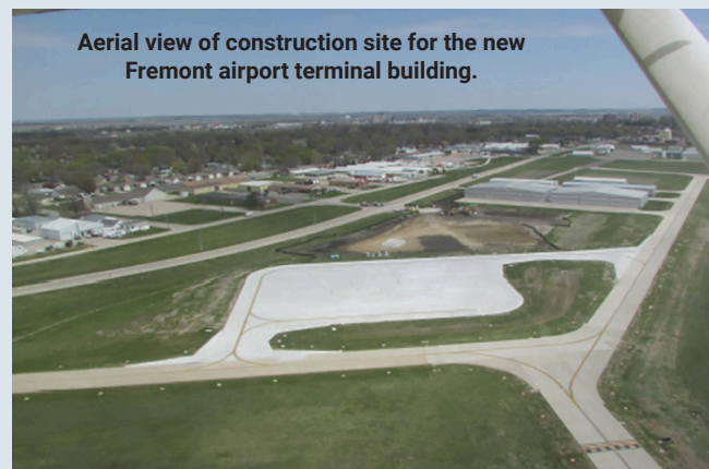
Aerial view of construction site for the new Fremont airport terminal building.

Of course, in a few weeks I will need another haircut. I'm already planning on trying Central City, where they also have a century-old Opera House! ■