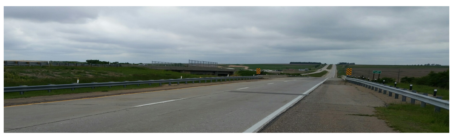
Here's a look at a 2+2 highway in Nebraska.

A 2+2 approach can often be used as a transition phase to a 4-lane highway. When the pavement of the existing roadway eventually needs to be replaced, NDOR would then convert the 2+2 segment to a 4-lane highway.