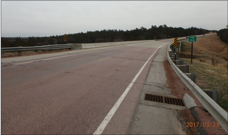
Long Pine Creek underneath the bridge (top left). The approach slabs and bridge surface looking west (bottom left) and east (right).