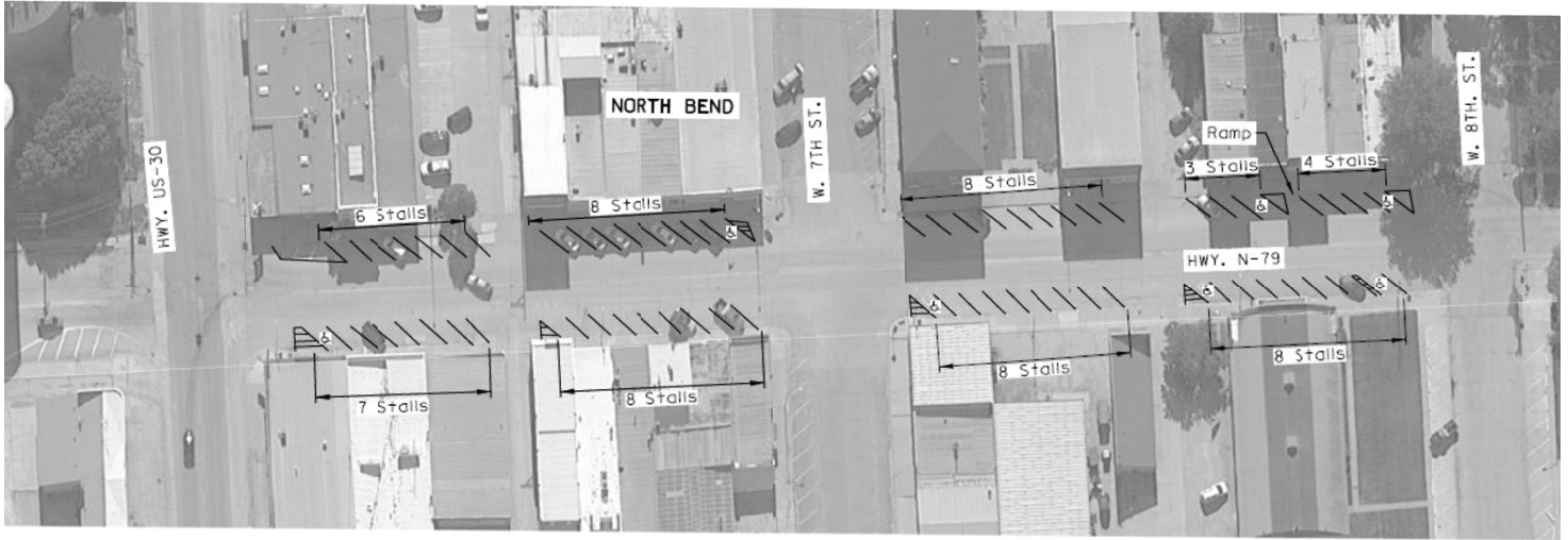
EXISTING ON-STREET PARKING