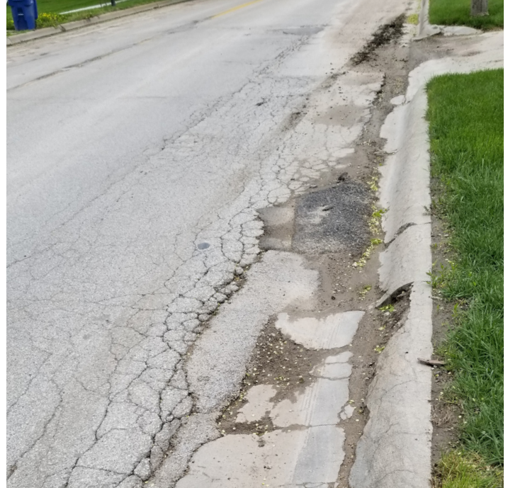
Pictured above: Deteriorating roadway conditions and drainage issues can be seen throughout the project area.

Construction is tentatively scheduled to begin in spring 2022 and could be completed by early 2023.