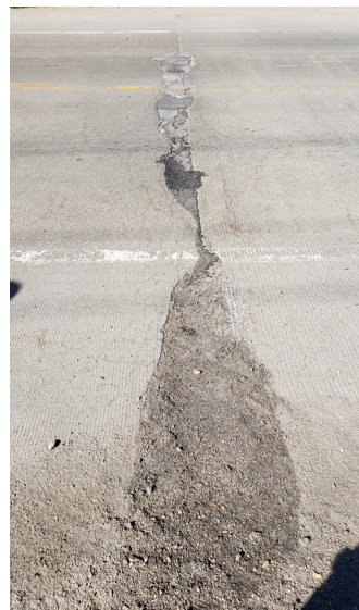
Pictured left and below: Expansion joint issues and pavement issues on both structures along the alignment.